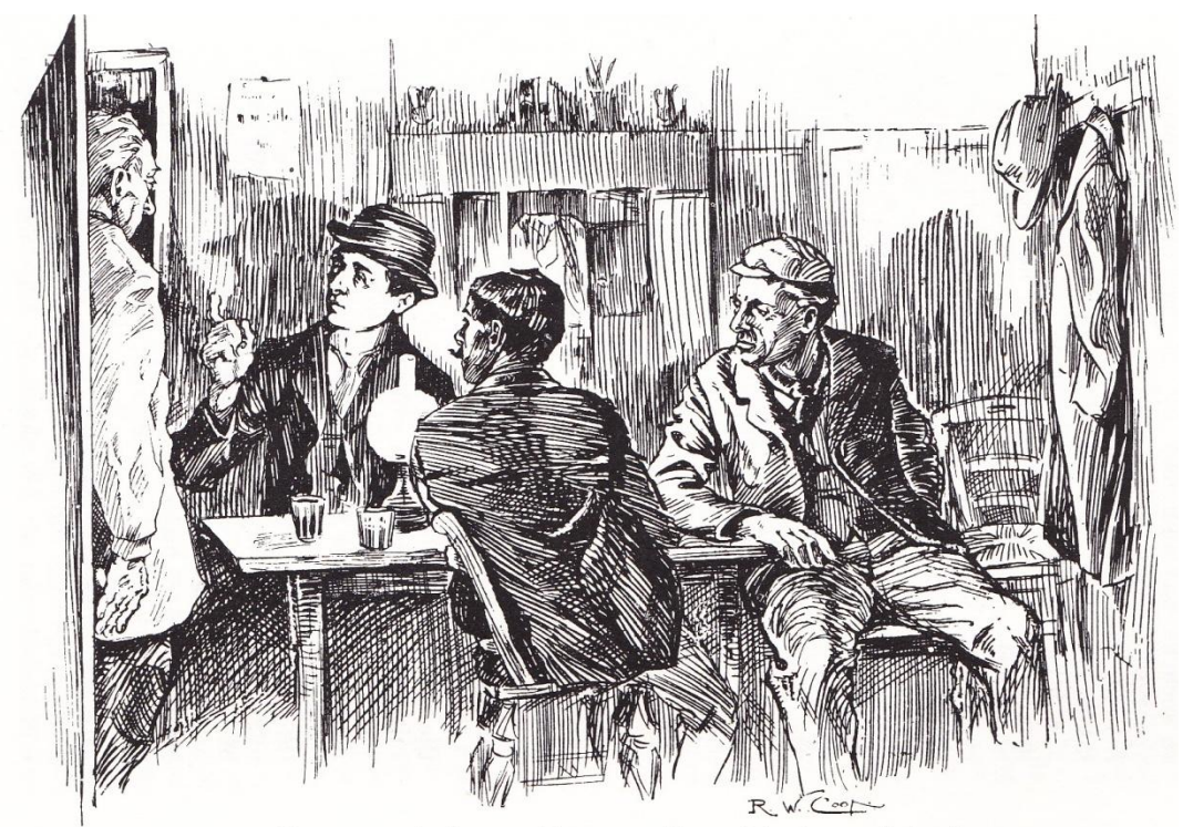
"The men were deeply engaged in a conversation carried on in an undertone."

These were a class of men devoid of all feelings of humanity, all sympathy for broken-hearted widows, affectionate parents, brothers or sisters-all pity for fatherless or motherless children, men, in fact, who made a living by rifling coffins of the bodies enclosed, for the purpose of selling them to the members of the medical profession, to be cut and mangled, in order that a better knowledge of the anatomy of the human frame might be acquired.